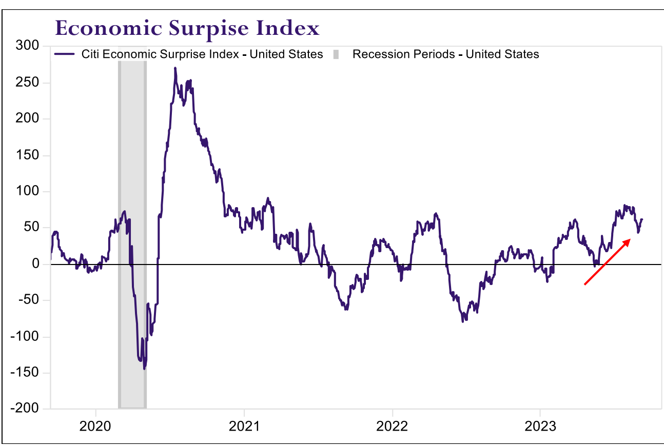
Figure 1: Citi Economic Surprise Index

Economic resilience has been the theme of the third quarter. Economic data has largely surprised to the upside in the second half of this year (Figure 1), just as we predicted, albeit sooner than we had anticipated. Looking at the Citi U.S. Economic Surprise Index, economic data has beaten expectations since late May and most of this year. This has many economists changing their recessionary outlooks. We have spoken at length about different recession scenarios. Will we experience a deep or shallow recession or no recession at all? While we have been more tempered in our outlook, calling for a shallow recession at some point in the next year, the idea of no recession is gaining traction with economists. As a reminder, a recession is a significant decline in economic activity spread across the economy that lasts longer than a few months. These are feared because when economic activity slows, companies are forced to lay off workers and their profits decline as people cut back on spending.